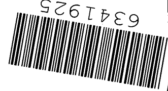
CRO receipt date stamp & barcode